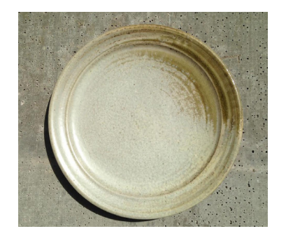
Rim Plate Ash glaze