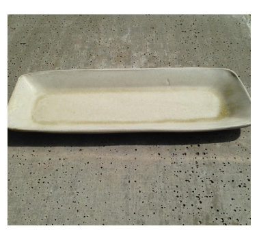
Tray Bone glaze