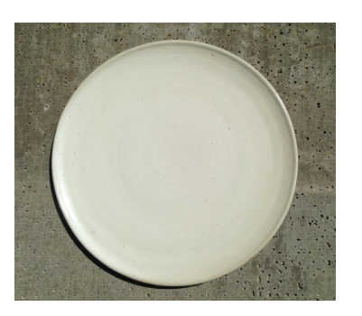
Classic Plate, no foot rim White glaze