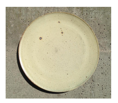
Classic Plate, with foot rim Bone glaze with iron spots