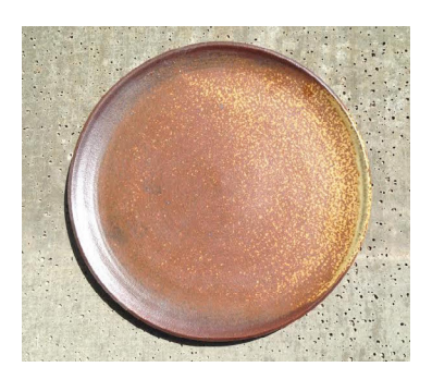
Slope Rim Plate Iron glaze