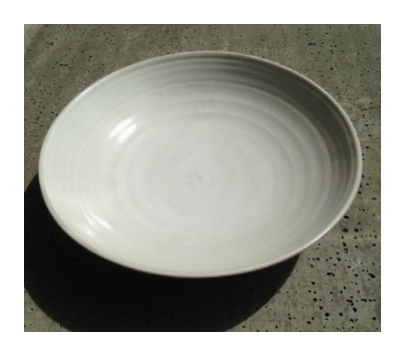
Deep Chef's Bowl White glaze