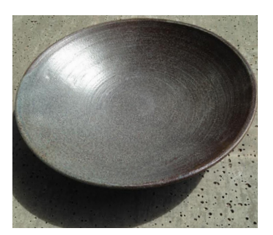
Chef's Bowl Black glaze