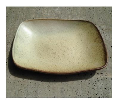
Comfort Dish Bone glaze