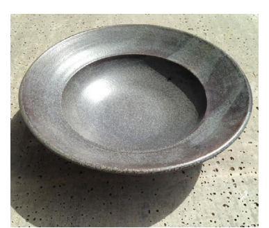
Pasta Bowl Black glaze