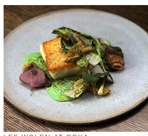
EE WOLEN AT BOKA