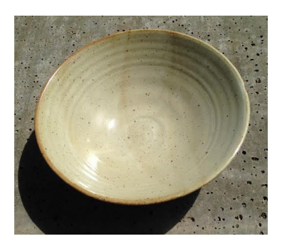
Small Deep Chef's Bowl White glaze