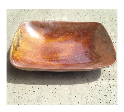
Comfort Dish Amber glaze