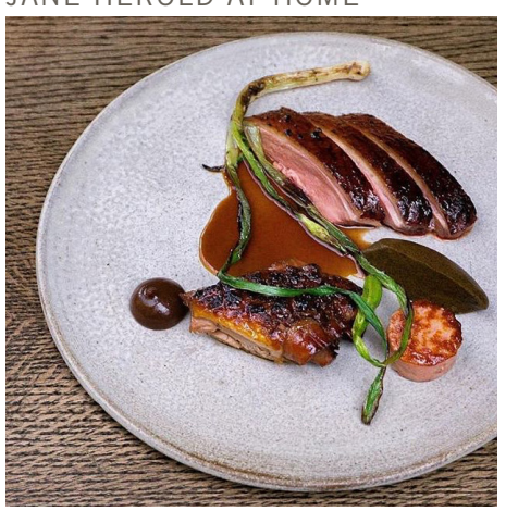
LEE WOLEN AT BOKA