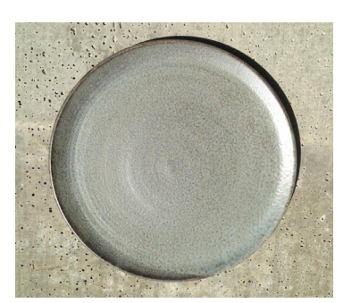
Slope Rim Plate Black glaze