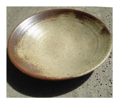
Chef's Bowl Bone glaze