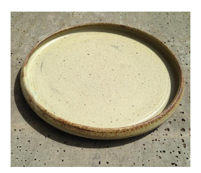
Flying Saucer Plate Bone glaze