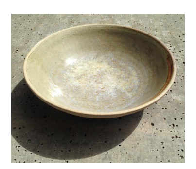
Ceviche Bowl Ash glaze