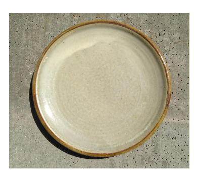
Coupe Plate, with iron rim Ash glaze