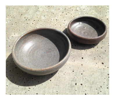
Dollop Bowls Black glaze