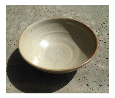
Amuse Bowl, with iron rim Ash glaze