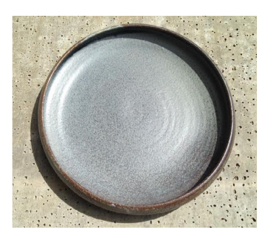
Clement Bowl Black glaze