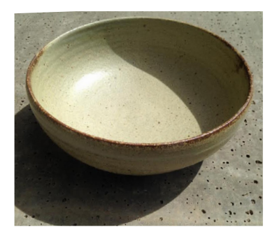
Bistro Bowl Bone glaze