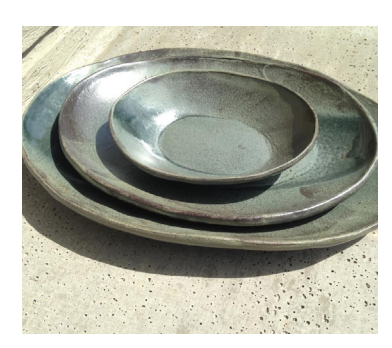
Oval Dishes Black glaze